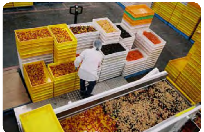
How The Natural Confectionery Co Jellies are made