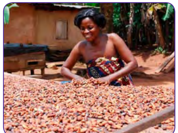
Ghanian Cocoa Farmer