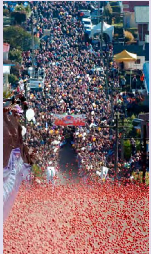
The Great Jaffa Race

The main event is the exciting Cadbury Jaffa Race where thousands of Cadbury Jaffas are rolled down Baldwin Street, Dunedin — the world's steepest street. The first numbered Jaffa through the chute is the winner! Since 2002, the Cadbury Jaffa race has raised more than $400,000 for charity.