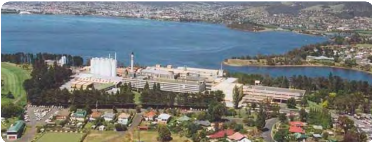
Cadbury, Claremont Tasmania

Learn more about Cadbury's history at http://www.cadbury.com.au/About-Cadbury/Cadbury-in-Australia.aspx