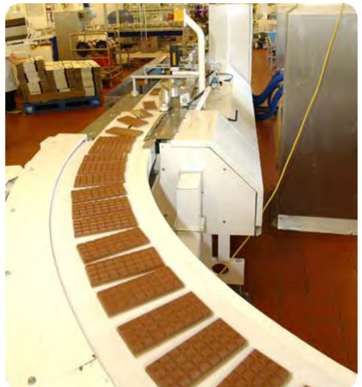
Cadbury® Dairy Milk™ Milk Chocolate in Factory