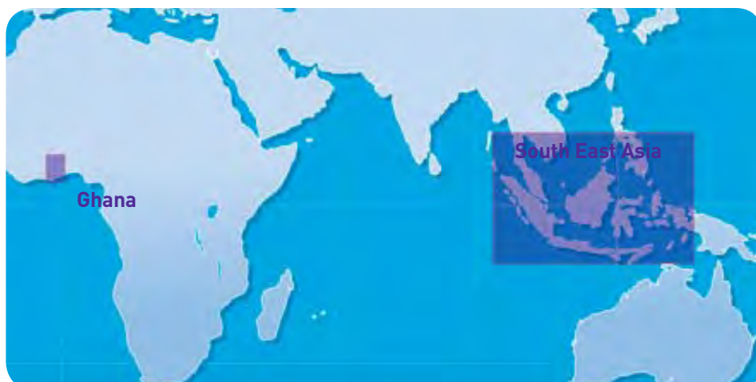
Cadbury Australia and New Zealand source their cocoa from Ghana, West Africa and South East Asia