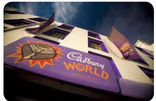
Cadbury World, Dunedin New Zealand

Have you ever wanted to see the inside of a chocolate factory? Well you're in luck! In Cadbury World in Dunedin, NZ, and Birmingham, UK, Cadbury share their love of chocolate with everyone. While there aren't any Oompa-Loompas dancing about, you can witness the magic and secrets of chocolate making.