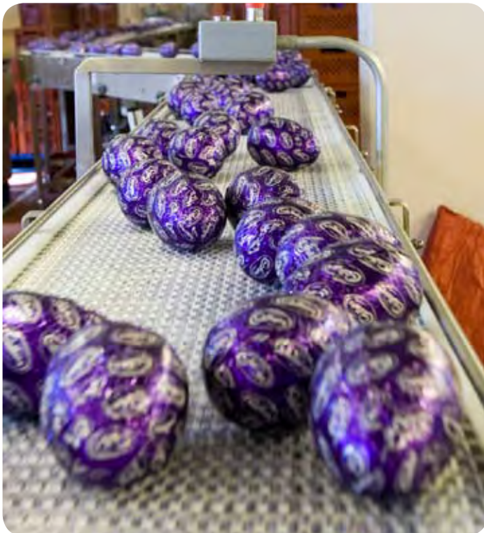
Cadbury Easter Eggs in Factory