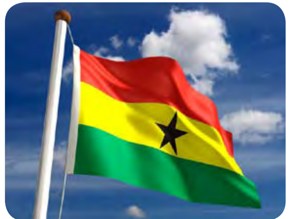
Flag of Ghana

The Cadbury Roses box was made to look like a style of handbag called the Dorothy.