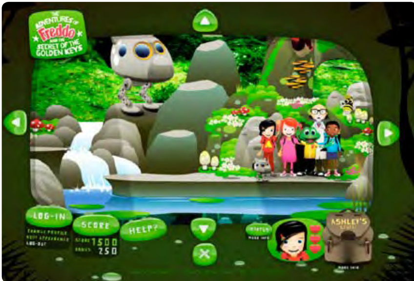
Go on an adventure with Freddo Frog